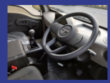
Stylish & Comfortable Steering Wheel