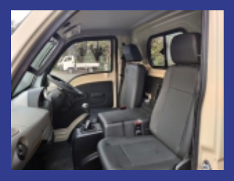
Seats with Head Rest & Ample leg room