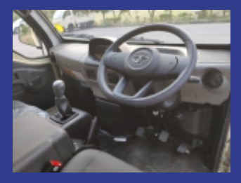
Effortless pendant type Accelerator, Brake & Clutch pedals