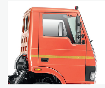
Cabin Safety – safer all steel cabin with stronger build quality for better safety to the Driver