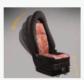
All weather proof Melba fabric seat with features like reclining, Sliding, and Height adjustable as pe weight for best in class driving comfort